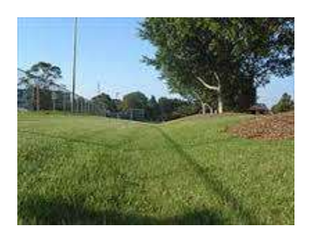
Municipal Drain - see attached Factsheet

Grassed Swale -a long shallow depression, much wider than it is deep. It is designed to hold storm water runoff and allow the water to sink into the ground